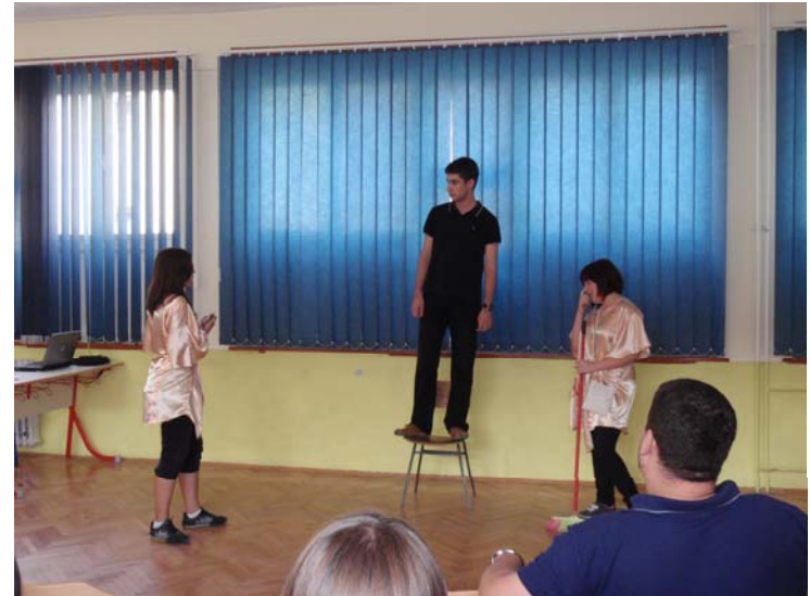
Peer educators and FM collaboration

FM teams and peer educators: Advocacy for YFHS