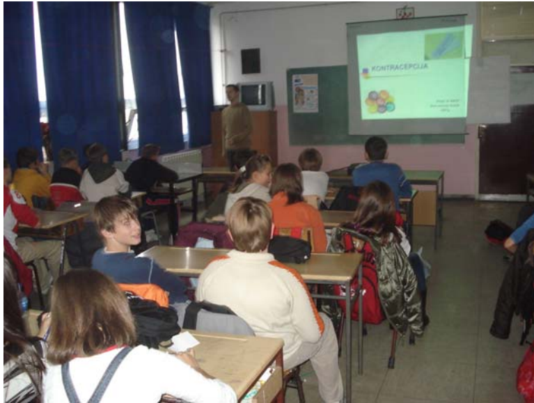
FM teams as educators