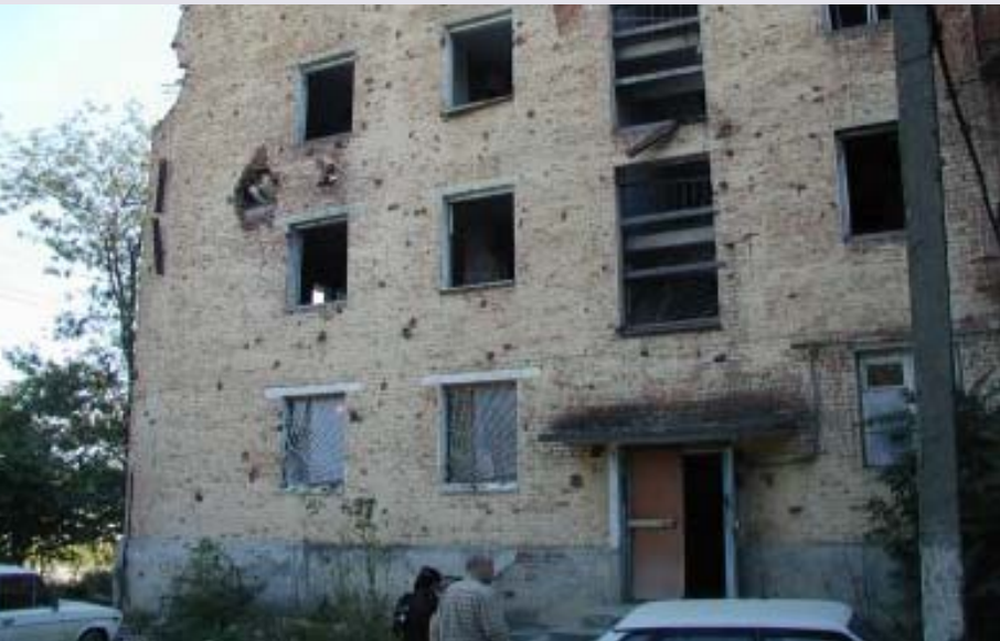
Entry of Polyclinic No.1, Grozny, Chechen Republic