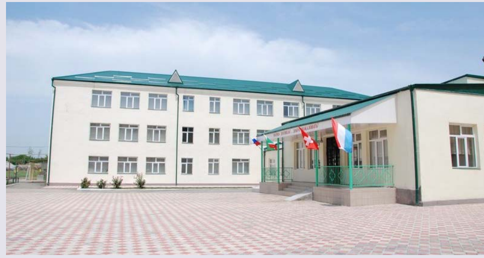
School #39, Grozny 2010