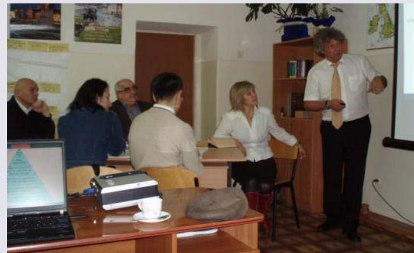
Project proposal writing