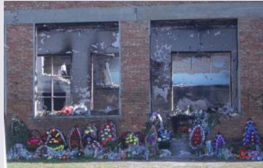
Gymnasium, School #1, Beslan, Republic of North Ossetia-Alania

Since 2001 SDC support focused on regional health program, durable housing for refugees and IDPs as well as on rehabilitation of schools in the North Caucasus