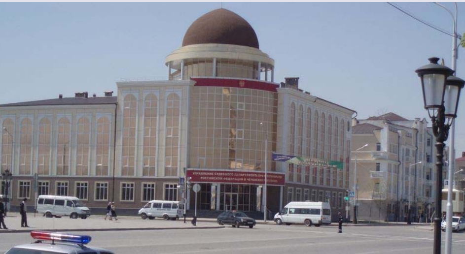
Putin “Avenue”, Grozny 2010

“Health is a Bridge for Peace” is a valid approach